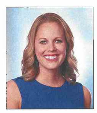
Practice Areas Trust, Estate & Charitable Planning