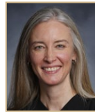
H. Caligiuri *Criminal Court