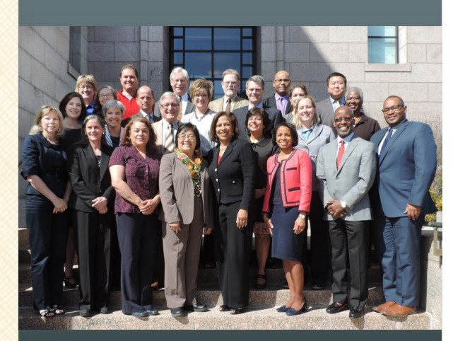
Committee for Equality and Justice Members

Diversity and Inclusion Resources.... Page 10