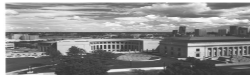
Minnesota Judicial Center, St. Paul