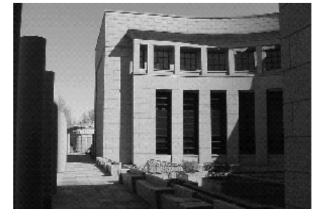
Minnesota Judicial Center, St. Paul

The Supreme Court grants review of approximately 12 percent of the 600-700 petitions it receives each year. The Court hears appeals from the Minnesota Court of Appeals, the Workers' Compensation Court of Appeals, the Tax Court, as well as election matters. The Court also automatically hears all first-degree murder appeals from the district courts.