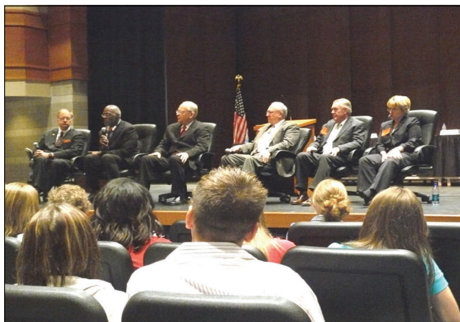
Members of the Minnesota Supreme Court take questions from students at Marshall Senior High School in Marshall, MN