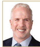
C. Sande *Civil Court