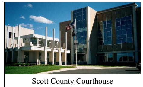
Scott County Courthouse