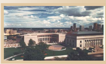
Minnesota Judicial Center, St. Paul, MN

Explore the possibilities waiting for you!