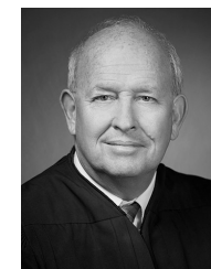
Judge James Florey