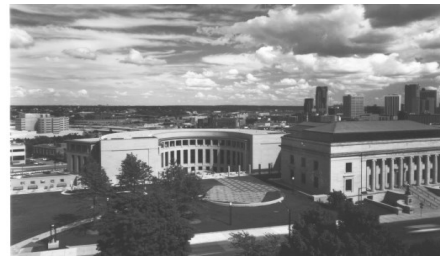
Minnesota Judicial Center, St. Paul