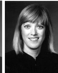
Judge Jill Halbrooks