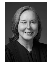
Judge Denise Reilly