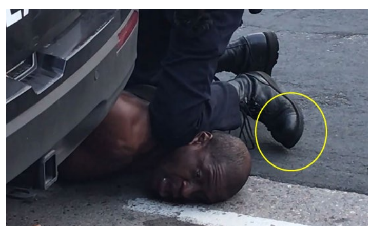
(Chauvin Ex. 15 (D.F. Video) at 2:33.)