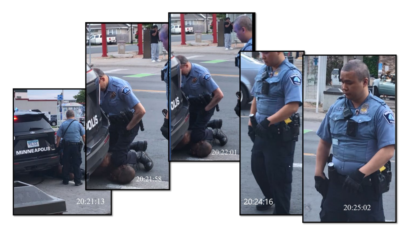
(Fed. Gov't Ex. 21 (Combined Milestone and D.F. video/audio).)

141.1.5. The following composite image shows illustrative moments of Thao looking at the restraint, and clearly perceiving the officer's interactions.