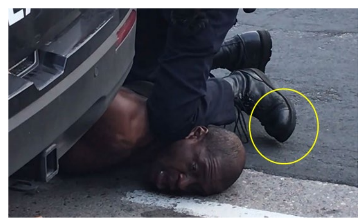
(Chauvin Ex. 15 (D.F. Video) at 2:33.)

Most shockingly, Chauvin did not even remove his knee from Floyd's neck when the ambulance arrived. Instead, as the following image shows, Chauvin continued to press his knee into Floyd's neck even as a paramedic checked for Floyd's pulse . (FF ¶ 131.10.)