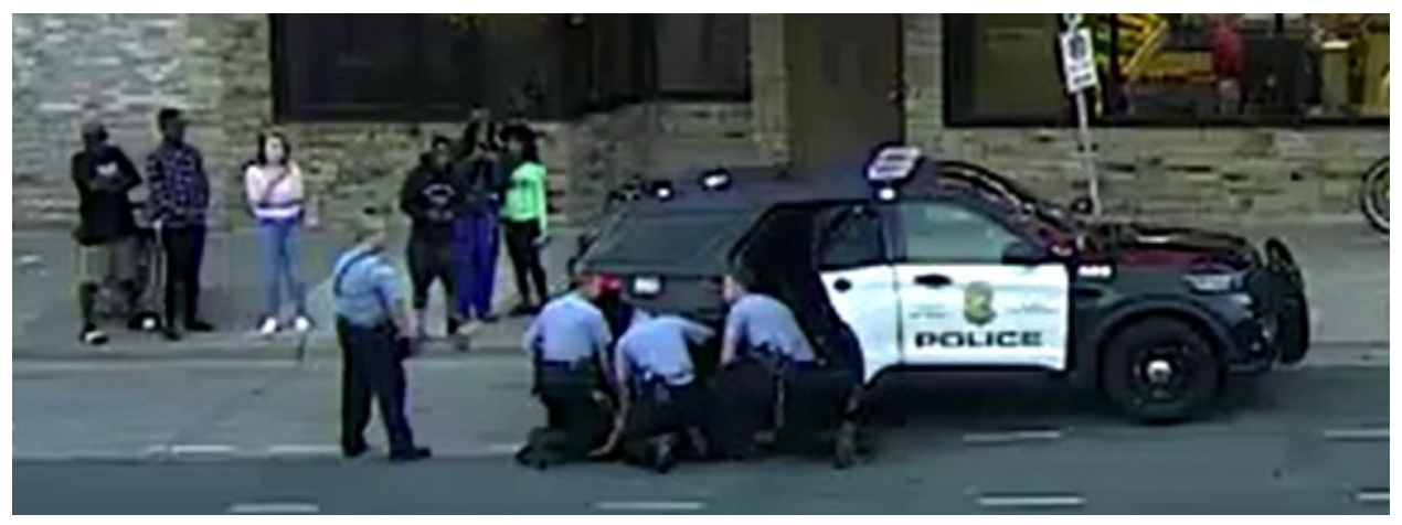
(Chauvin Ex. 42 (Milestone Video) at 8:25:04.)

continued observing the restraint and prevented the bystanders from intervening to help Floyd. Here is a photo showing Thao approximately six minutes into the restraint: